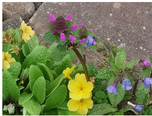
Dead Nettle (Purple) Primula (Yellow)