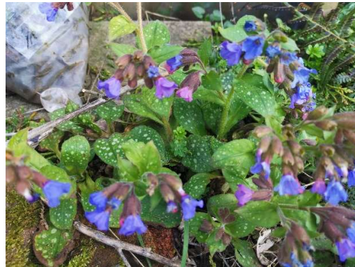
Pulmonaria (Blue with spotted leaves)