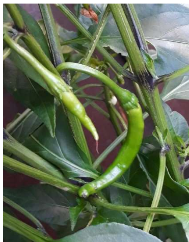
Chili looking good