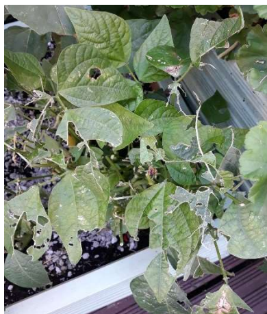
Green beans attacked by snails, but the handful we got were delicious!