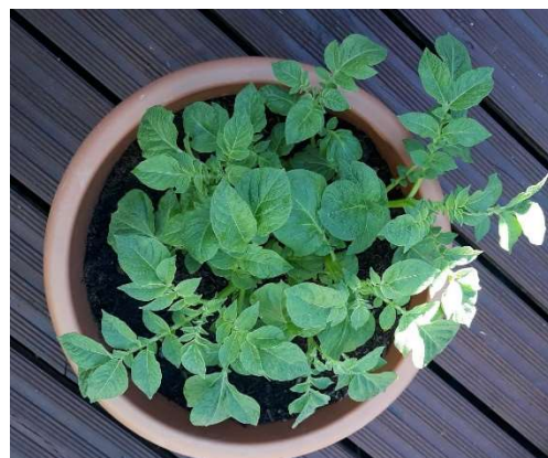
Holding out for the potatoes