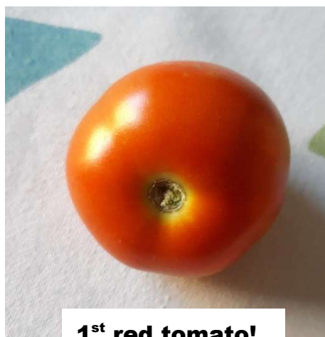
1 st red tomato!